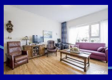
Housing with care