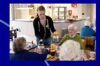
Active citizens / volunteering