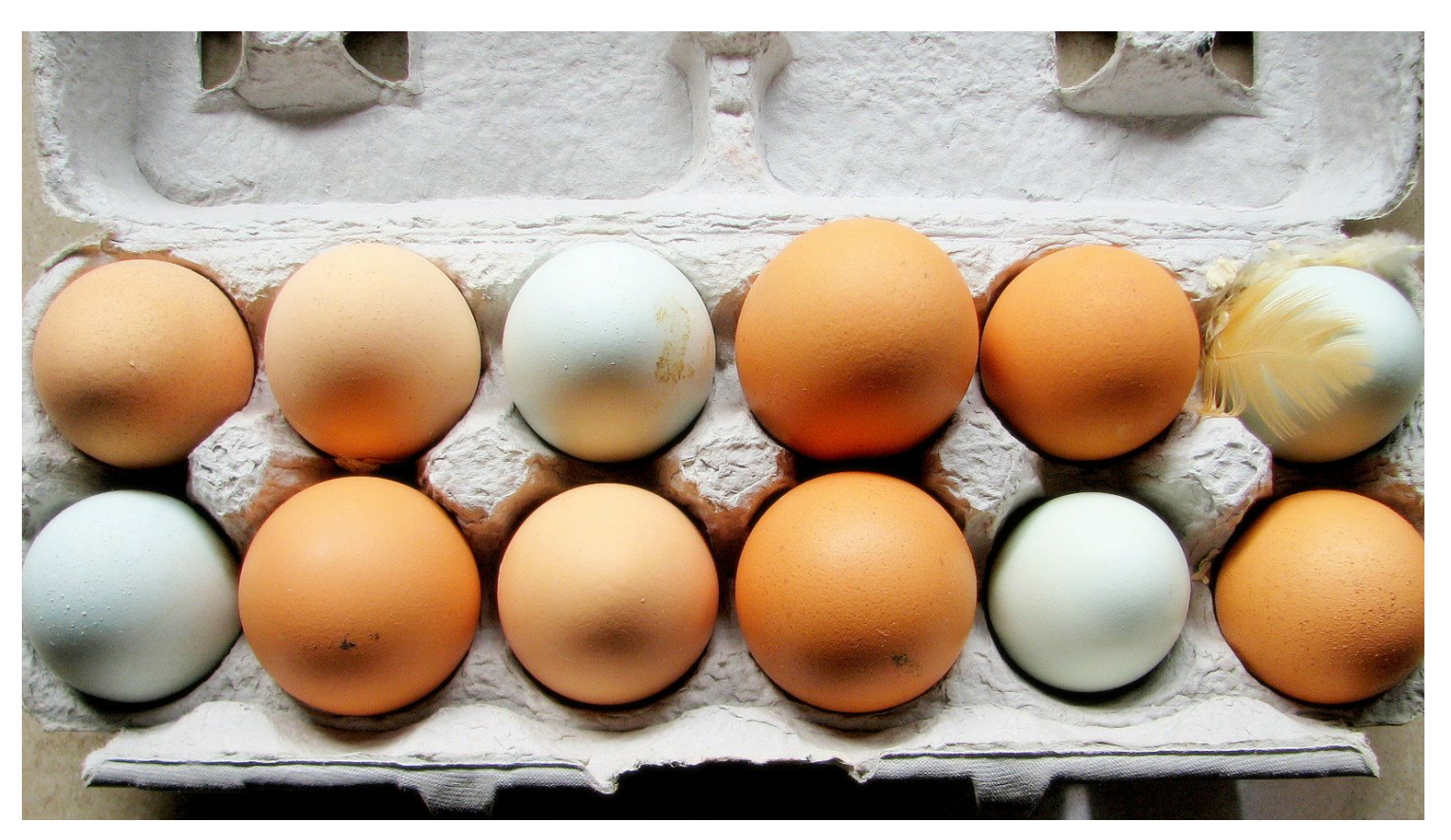
BBC http://www.bbc.co.uk/news/education-11757907 accessed 25 May 2017