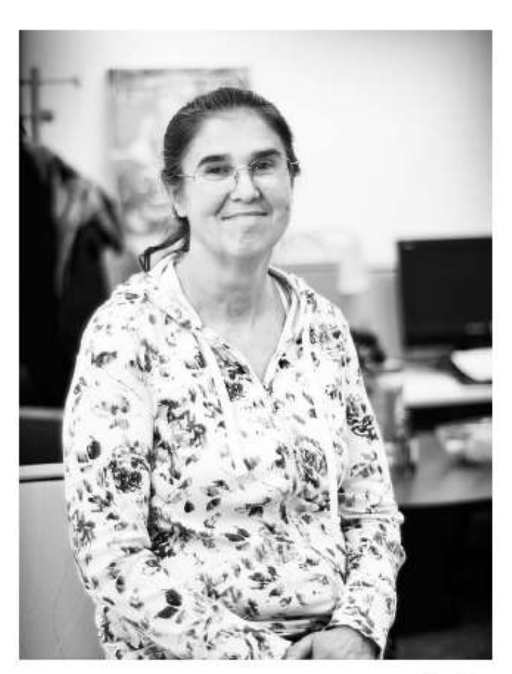
"My mind is always on his needs, my family needs, and work needs. It is like you are working all the time - 24 hour care."