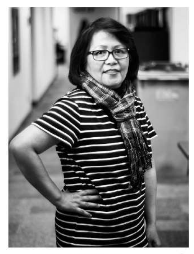
"To be able to look after my dying father and youngest brother until their last breath was the best care I ever gave".