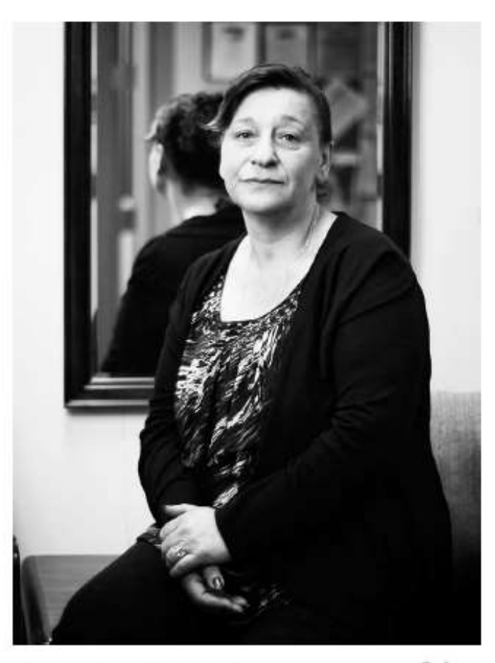
"I have always wanted to look after my mom by myself. Financially, I couldn't. I needed to work."