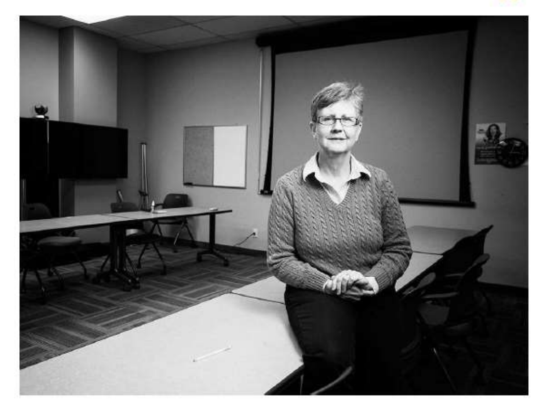
"It is like I am pacing myself for a marathon – I just live day by day and try to keep going somehow."